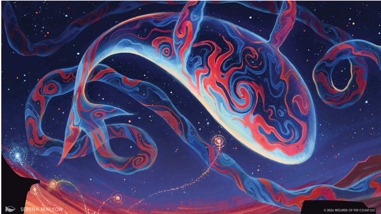
Spectacular Skywhale | Art by: Serena Malyon

“Is that—from the Whale Trench?” Kahri sputters. “But they’re harmless, they’re just constructs, they can’t—”